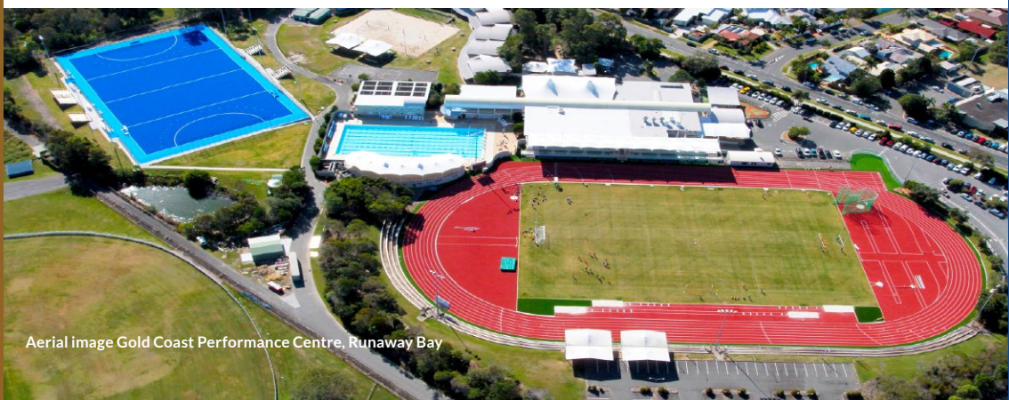
Aerial image Gold Coast Performance Centre, Runaway Bay